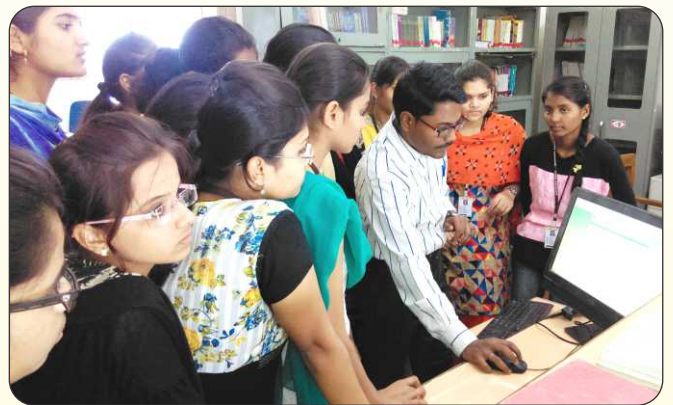
Orientation on INFLIBNET N-LIST & OPAC