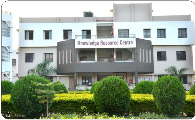
Knowledge Resource Centre