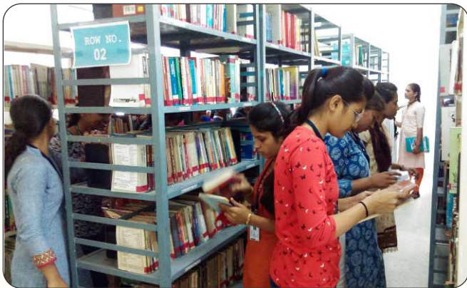
Open Access to all users