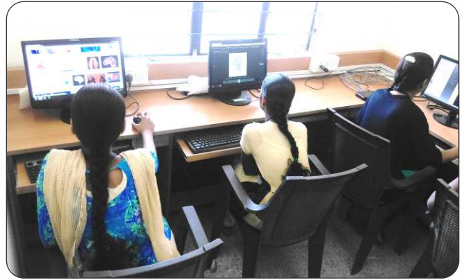
Students searching online information at I.R.C.