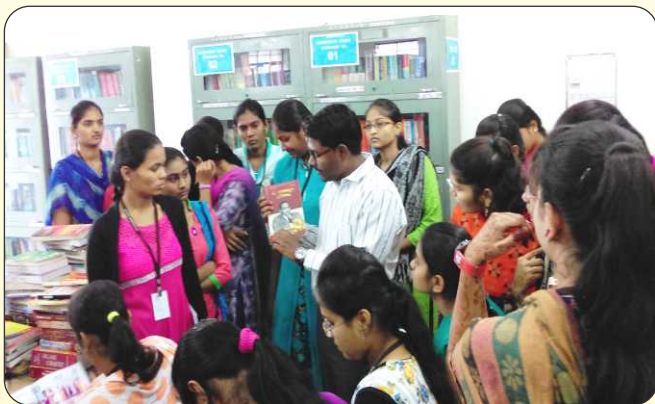
Library Orientation Programme